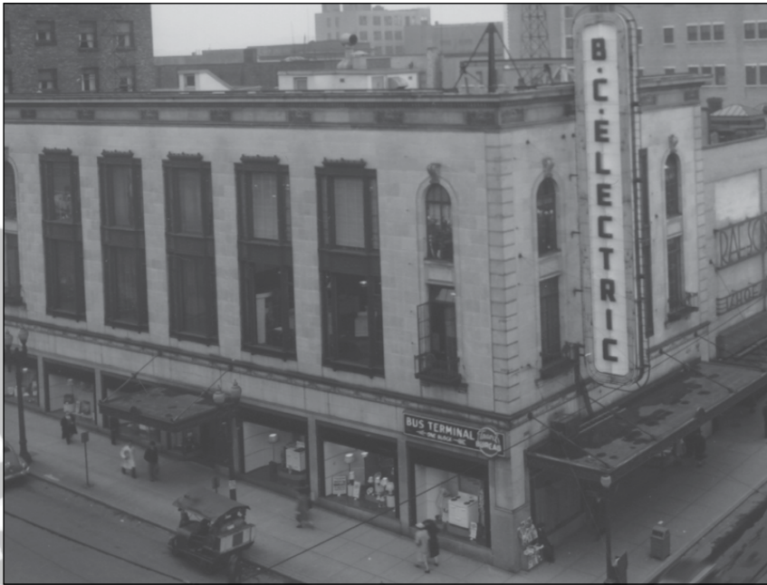
BC Electric Showroom 1940s

sor to Science World. Abandoned for over ten years, the building is crumbling from water damage and may soon be beyond repair.