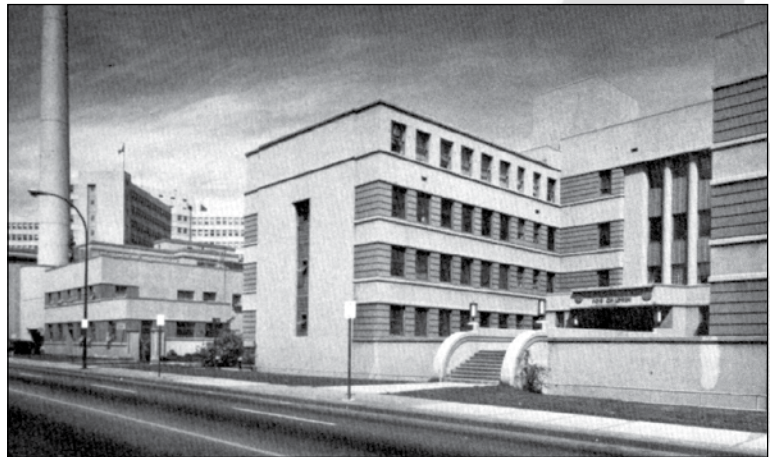
Vancouver General Hospital

Heritage Register. A purchaser willing to move them may be their only hope.