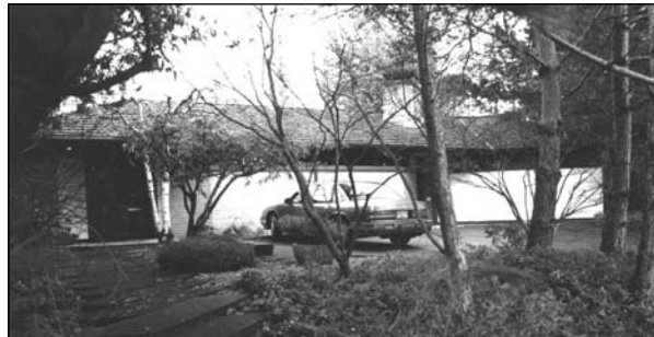
Flader house, 607 West 51st Avenue